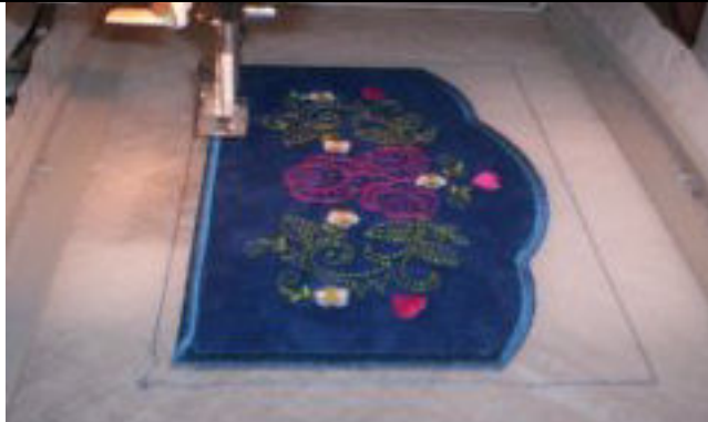
9. Now....make front wrap piece following same steps above but keep wrap hooped when finished!