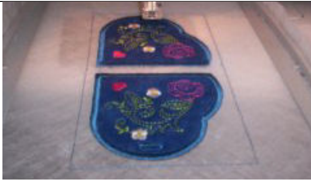
7. Next step stitches satin edge on both pieces. Continue stitching design using instructions in text files.