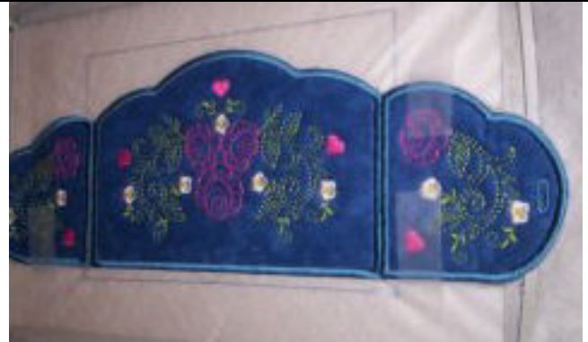
10. Tape back pieces to each end with sides touching, even along the bottom. Put hoop on machine.