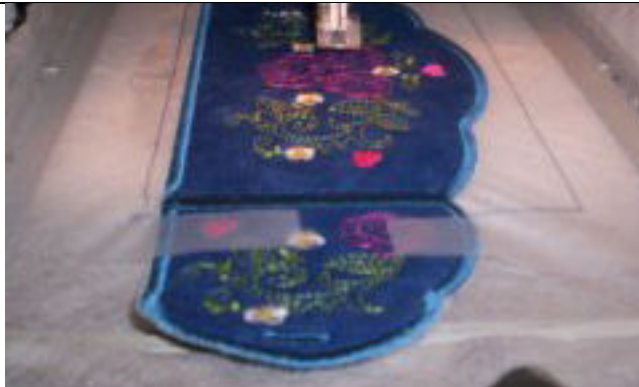
11. Last step joins back wrap pieces to front with a wide zig-zag stitch on each end.