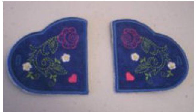
8. Remove hoop & trim from stabilizer. Do NOT wet to remove stabilizer bits from the edges yet! Set aside.