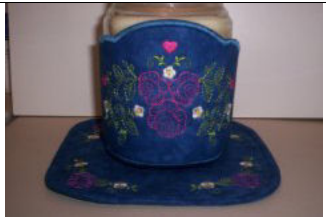
14. Here is your finished candle set!