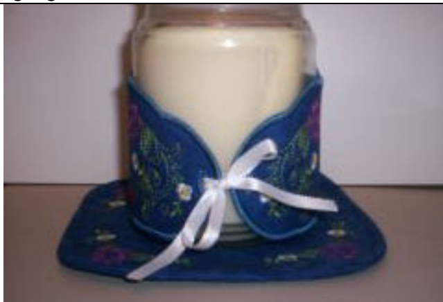
13. Thread ribbon through buttonholes and tie in bow. (See "Adding ribbon to Bow-tie wrap" PDF for help!)