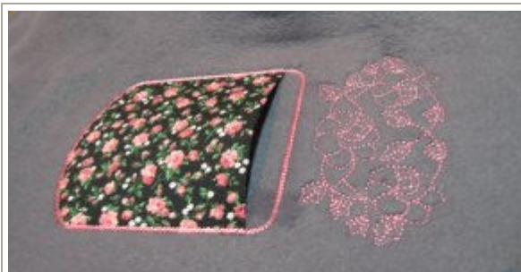
9 – Last step finishes the edge of the pocket. Remove from hoop and trim stabilizer close to the design.