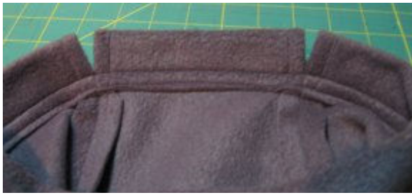
11 – Re-open the seams on each side at top to create openings to insert the tubing and the ribbon hanger strips.