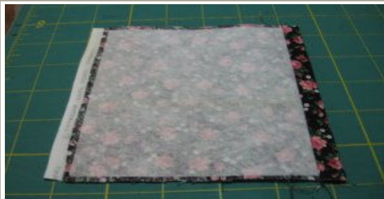
3 – This just shows the back of the pocket after pressed. Top stitch along the top and set aside.