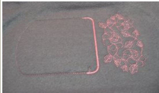
4 – 1 st color stitches design. Next color stitches pocket outline.