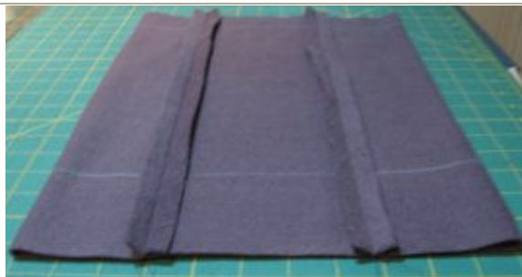
8 – Pin 16" long sides of large piece to 6" x 16" fabric strip and stitch the strip to the larger piece with a 5/8" seam allowances.