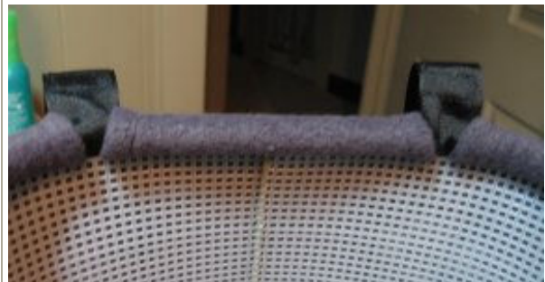
16 – Push/pull tubing inside channel until the wooden dowel is centered between the openings. (this will keep the design centered on the caddy front)