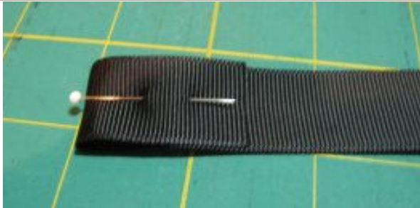
13 - Cut ribbon strip in half, singe cut edges with lighter too. Mark 3" lines on ends & fold to a 1 1/2" loop, stitch across ribbon to secure.