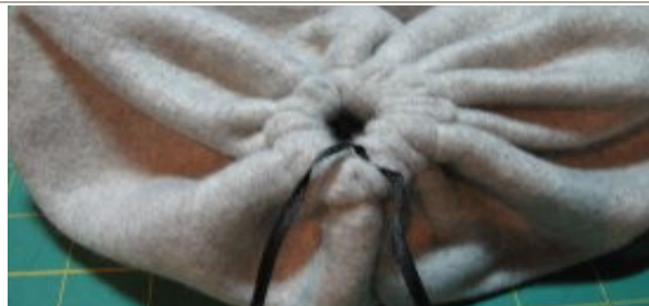
17 – Cut small slit inside bottom channel and thread 1/4" ribbon through channel. Pull ribbon to gather fabric as tight as possible and tie in a knot. Pull ribbons ends to the inside, no need to trim. This forms the bottom of the caddy.