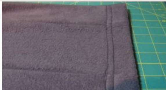
10 - Fold top down to 3" line & top stitch 1/4" from cut edge. Stitch 2 nd row of stitches 3/8" above 1 st row to create a channel.