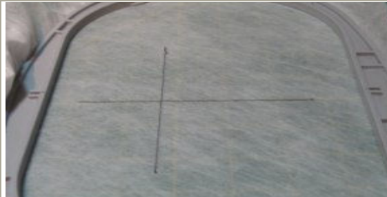
4 - Hoop cutaway stabilizer. Stitch placement lines on the stabilizer only, no fabric yet.

NEXT....ADD DESIGN & POCKET TO CADDY FABRIC – cut fabric to the sizes listed in the text file.