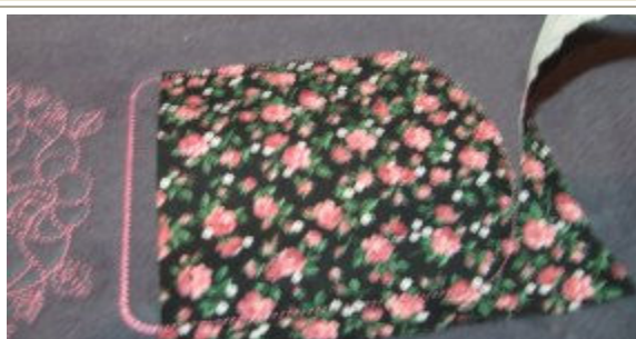
8 – Next step tacks pocket down. Remove hoop and trim excess fabric around pocket. Put hoop on machine.