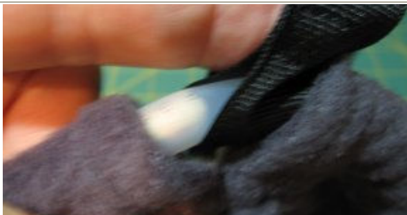
15 – Feed plastic tubing (with dowel inside) into channel through opening. As tubing reaches opening insert ribbon ends to catch tubing & continue feeding tubing through channel. At end, push tubing over dowel to center mark.