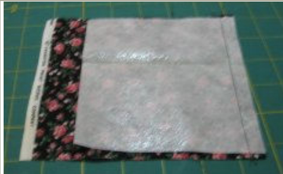
1. With non fusible side of interfacing and right side of fabric facing each other, stitch 1/2" seam along one 5" edge.

PREPARE POCKET 1st! – cut cotton fabric & interfacing to size listed in text file provided with designs.