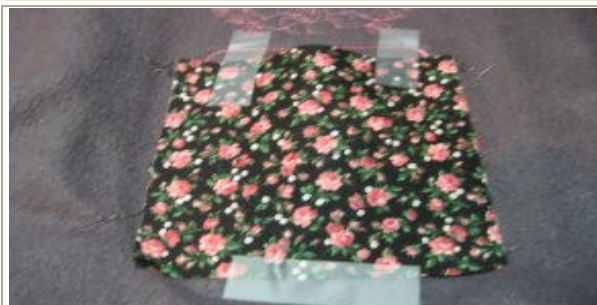
7 - Tape pocket in place along the sides and the bottom. Put hoop on machine.