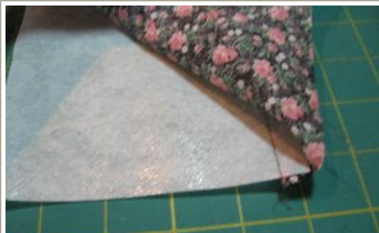
2 - Flip fabric up and over top edge of interfacing and press to fuse the fabric to the interfacing.