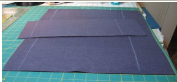
1 – Mark lines across along the long sides & the 6" ends of narrow piece. (3" line at top, 1 1/2" line at bottom)

NEXT....ADD DESIGN & POCKET TO CADDY FABRIC – cut fabric to the sizes listed in the text file.