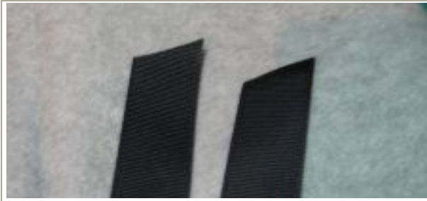
12 - Cut ribbon at an angle on each end. Lightly singe cut edges with disposable lighter to keep ribbon from raveling.