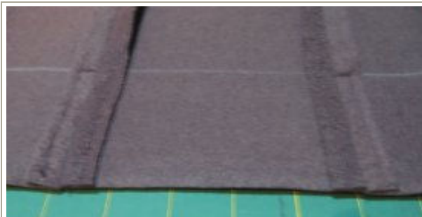
9 - Top stitch seam allowances open flat (like putting in a zipper) to 3" line at top and to the 1 1/2" line at the bottom.