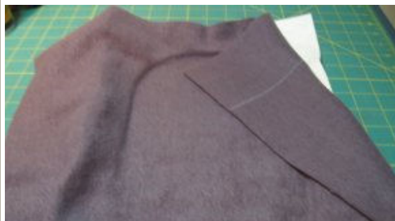
3 – Fold fabric out flat using the placement lines as your guide to keep fabric straight. Use temporary adhesive spray to secure in hoop. The 3" line on back of fabric at the top!