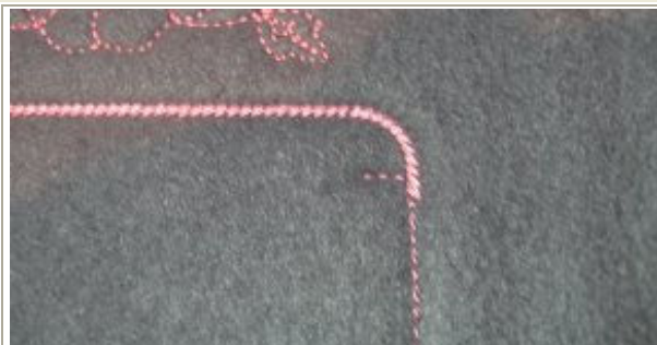
5 – Notice the short placement lines stitched on each side of the pocket outline