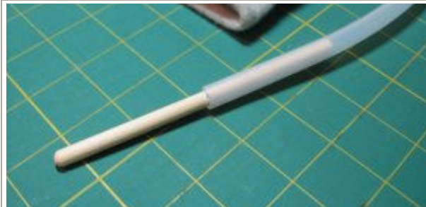
14 – Mark the center on the dowel (2 1/2") and push the dowel inside the plastic tubing to dowel center mark.