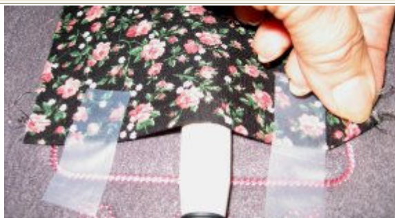
6 - Center pocket over outline keeping top even with short placement lines at the sides. Slip end of a seam ripper or a fat pencil under top of pocket to create a gap (Allows room to easily slip an item into the pocket!)