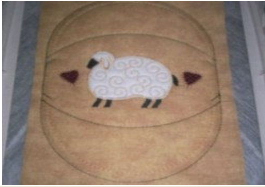
7 - Next step tacks fabric & Insul-Bright down. Also stitches curved lines across mitt face and some short placement lines at the sides for pocket placement guide.