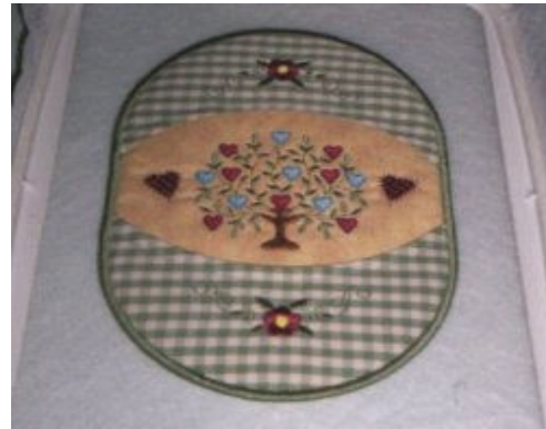
10 - Last step is the satin stitched edge. Remove hoop, flip over, trim hot mitt from stabilizer and run a warm wet rag along edge to dissolve any remaining stabilizer and let dry.