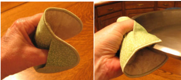
11 - Shows how your fingers and thumb fit nicely inside the pockets for added protection when handling hot items.