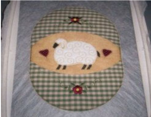
9 - Next step stitches pockets down. Remove hoop & trim excess fabric/batting from both sides of hoop. Trim pocket fabric first, then the rest. Put hoop back on machine.