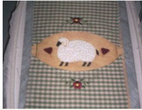
8 - Center pockets over ends keeping curved pocket edges even with short placement lines, keep pockets centered on mitt at sides as well! Tape in place, put hoop on machine.