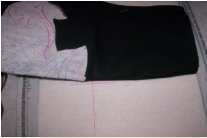
7 – Next, hoop more stabilizer and stitch right side of quilt motif following same steps above...