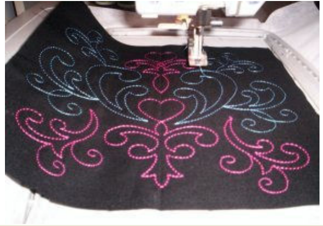
8 – Stitch right side of quilt motif. When finished, remove hoop & trim stabilizer close to design.

NOTE: These instructions apply to the smaller one hoop motifs! Of course you only have to hoop once on those!