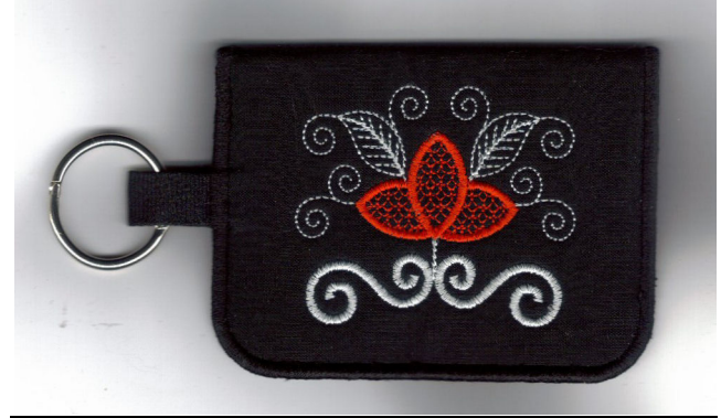
Coin Fob back