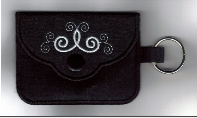
Coin fob Front

12. This picture shows both pieces of the snap properly installed on the coin fob.