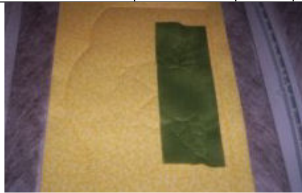
6. Place appliqué fabric over outlines following the instructions provided in the text files.