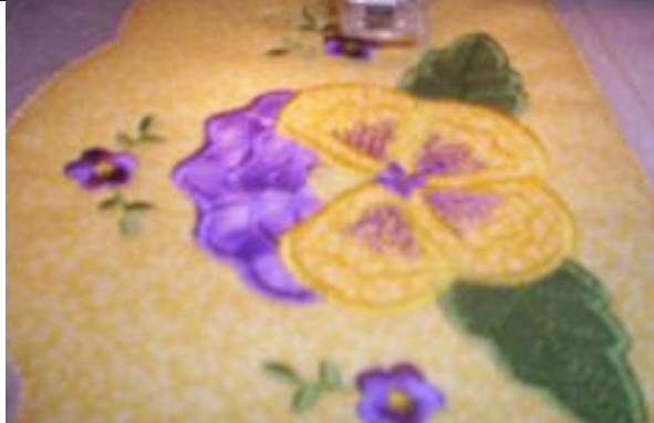
9. This picture shows the finished design stitched out.