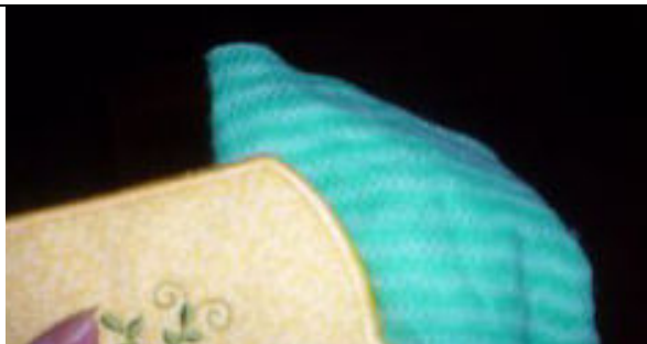
11. Trim design from stabilizer. Run warm wet rag along edge to dissolve remaining stabilizer. Let dry.