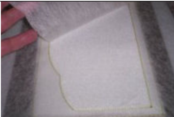
3. Remove hoop, flip to backside. Trim the vilene from inside the outline.