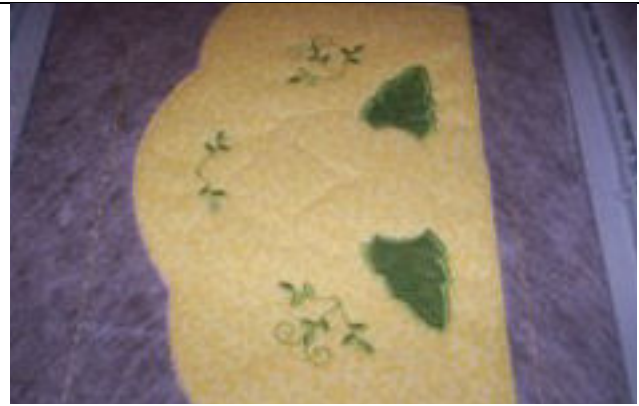
8. Continue stitching design following instructions provided in the text files.