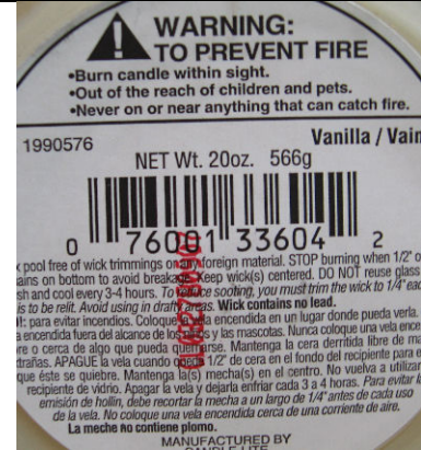
(Label on bottom of jar)

These candle wraps were designed to fit 20 oz jar candles (or shorter jars with the same jar circumference). The candle jar shown above was purchased at Wal-Mart. Note: For these candle sets (joined at sides with zig-zag stitch) be sure to take a finished wrap along with you to purchase the jar candles. We have discovered the jar circumference varies in size and some jars may be too big to fit!!