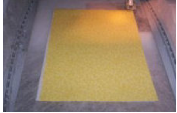
2. Remove hoop, center fabric (fleece ironed to wrong side) over outline. Tape at corners, replace hoop.