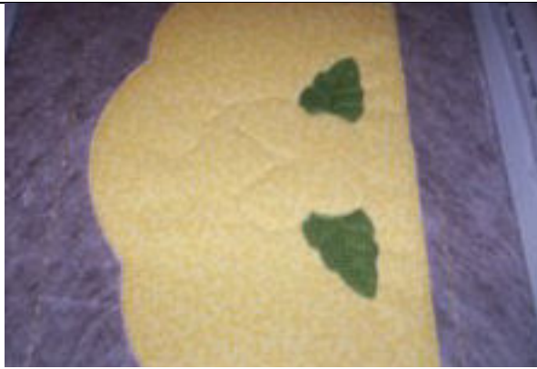
7. Trim all appliqué fabrics close to outlines.