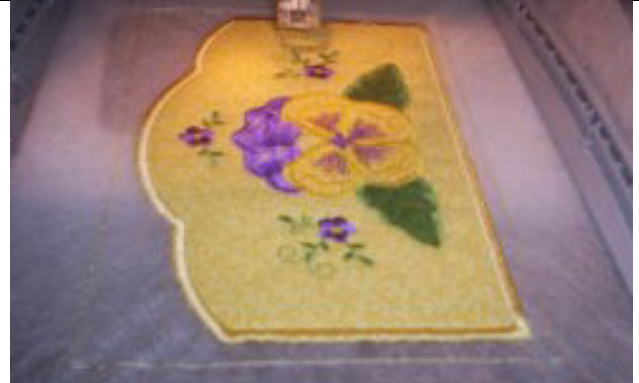
10. Last step stitches satin edges around wrap piece. (Use same color thread in bobbin!)