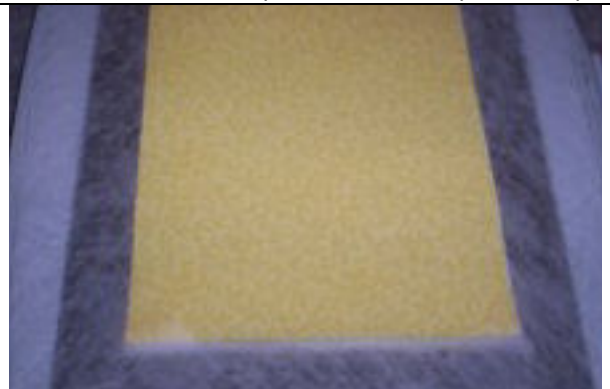
4. With hoop still on back side, center prepared lining fabric over outline. Tape at corners. Replace hoop.