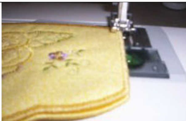
13. Next, fold wrap (right sides facing), stitch opposite side with same zig-zag settings but let zig-zag stitches drop off edge a little so turned right side out the sides meet without overlapping. Or stitch last side together by hand!