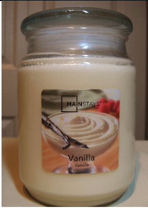
Mainstays jar candle from Walmart