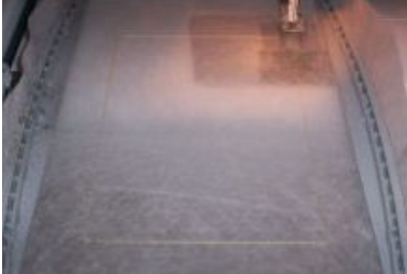
1. Sew initial placement outline on vilene only.

TIP: STARCH ALL FABRIC UNTIL NICE & CRISP FOR EASIER TRIMMING!