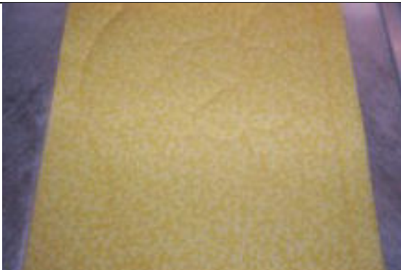
5. Next color tacks fabric down, stitches design outline.