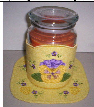
14. Make matching mat using the Candle Mat PDF file provided on the HOW TO page on my website.